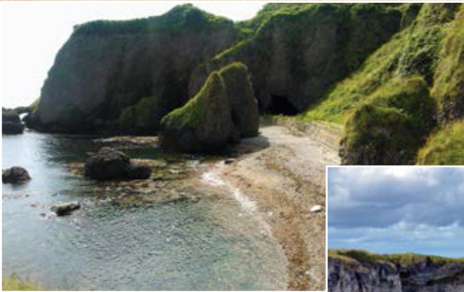
(l-r) Cushendun Coves, Larrybane Head

The clock is ticking, though, and there are more choices to be made. Leaving Glenarm you can either travel inland for just under 10 miles until you reach the Shillanavogy Road in the shadow of Slemish Mountain (OR) carry on along the coast road to the beautiful villages of Cushendall and Cushendun . Slemish is where St Patrick , Ireland's patron saint, tended sheep after being brought to the area by pirates who slaughtered his family. It's the sort of barbarism that would have won favour with the warlike Dothraki horde and a suitably appropriate setting for the Game of Thrones scenes where Daenerys Targaryen first learns what a Khaleesi is, and she, Ser Jorah Mormont, and the Dothraki horsemen ride through the grasslands en route to Vaes Dothrak.