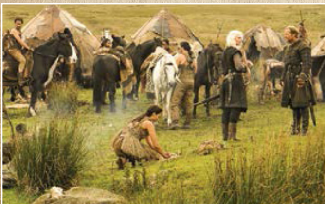
Slemish - Shillinavogy Valley

Seven is indeed the magic number for it is only seven miles past Larne , know as gateway to the Glens [of Antrim] , that you will come across Cairncastle (near the village of Ballygally). It was here that it all began, so to speak, and where you encounter your first dilemma. It was here on the windswept Antrim Plateau that Game of Thrones kicked off in dramatic fashion with Ned Stark beheading the Night's Watch deserter, witnessed by Jon Snow, Theon Greyjoy, and the Stark brothers Robb and Bran; and where Catelyn captures Tyrion Lannister whom she suspects of trying to kill her son. When Bran, Rickon, Osha, and Hodor head north to The Wall it is also from the land above Cairncastle that they take a last look back at Winterfell.