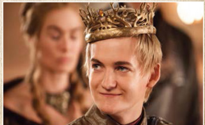
Joffrey's Crown - courtesy Steenson's Workshop

Steensons Jewellery Economusee is where many of the stunning pieces for the series were crafted such as Joffrey's crown, Lannister lion pendants, stag pins, and silver fish brooches. What's more, you'll be welcome to watch the craftsmen at their work and perhaps purchase something special for yourself.