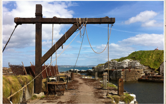
Ballintoy Harbour

THE CAUSEWAY COAST AND GLENS GAME OF THRONES ITINERARY LETS YOU EXPERIENCE THE FANTASY WORLD OF AUTHOR GEORGE R.R. MARTIN FOR YOURSELF. PLOTTING A PATH THROUGH THE SCENIC SPLENDOUR OF THE SEVEN KINGDOMS, IT TAKES YOU TO WHERE SO MANY OF THE PIVOTAL SCENES WERE SHOT.