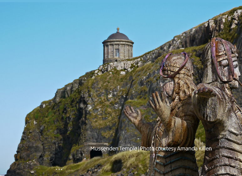
Mussendun Temple | Photo courtesy Amanda Killen

Visit causewaycoastandglens.com for lots more information on activities, attractions, events and itineraries in Northern Ireland's Causeway Coast and Glens.