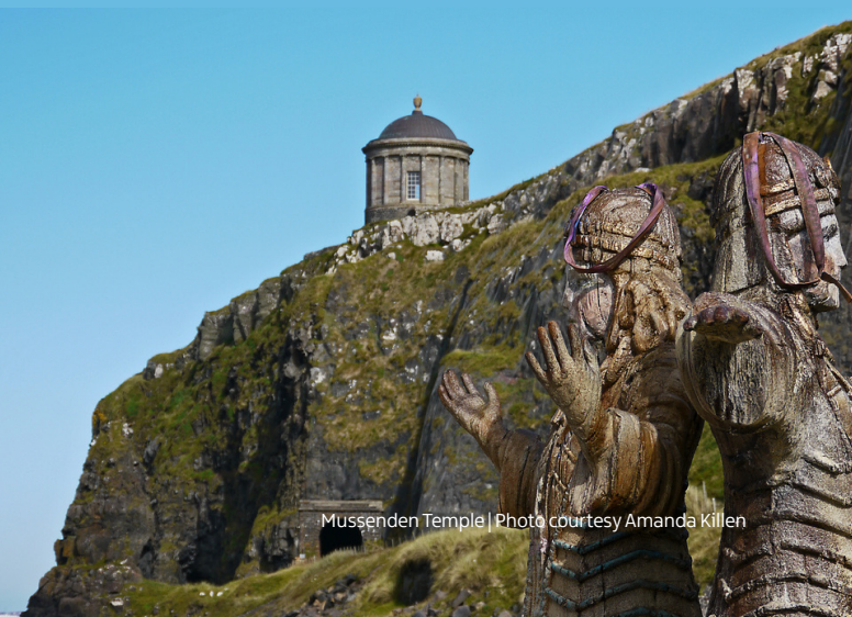
Mussendun Temple

Visit causewaycoastandglens.com for lots more information on activities, attractions, events and itineraries in Northern Ireland's Causeway Coast and Glens.