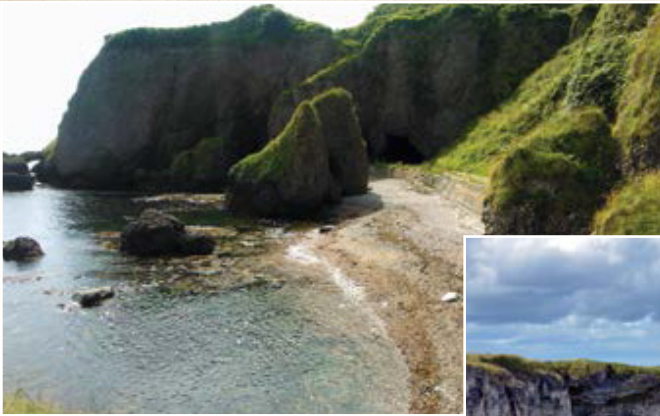
(l-r) Cushendun Coves, Larrybane Head

Option Two is to leave good old St Patrick and Slemish for another day and continue on from Glenarm along the coastal route, through Cushendall , to Cushendun , a village favoured as a holiday destination by Hollywood star Liam Neeson. It was in the caves at Cushendun, easily accessible on foot, that the Game of Thrones crew filmed the dramatic scene from Season Two in which Davos Seaworth, on the orders of Lord Stannis, takes the sorceress Melisandre ashore where she gives birth to a shadowy baby (which eventually killed Renly).