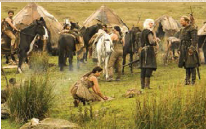
Slemish - Shillanavogy Valley

Seven is indeed the magic number for it is only seven miles past Larne, known as gateway to the Glens [of Antrim] , that you will come across Cairncastle (near the village of Ballygally). It was here that it all began, so to speak, and where you encounter your first dilemma. It was here on the windswept Antrim Plateau that Game of Thrones kicked off in dramatic fashion with Ned Stark beheading the Night's Watch deserter, witnessed by Jon Snow, Theon Greyjoy, and the Stark brothers Robb and Bran; and where Catelyn captures Tyrion Lannister whom she suspects of trying to kill her son. When Bran, Rickon, Osha, and Hodor head north to The Wall it is also from the land above Cairncastle that they take a last look back at Winterfell.