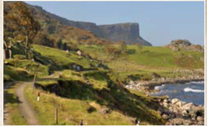
Murlough Bay & Fairhead

From Cushendun it's on to the magnificent Murlough Bay with its views of Rathlin Island , Mull of Kintyre, and the Scottish Islands. Used as the road to Pyke on which Theon