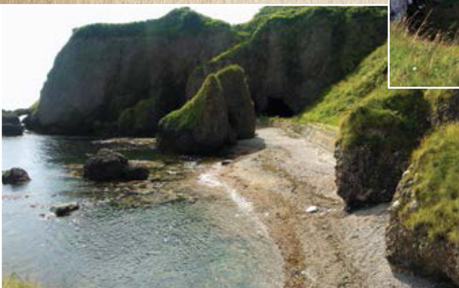
(l-r) Cushendun Coves, Larrybane Head

Leaving Glenarm you travel inland once more for just under 10 miles until you reach the Shillanavogy Road in the shadow of Slemish Mountain . St Patrick , Ireland's patron saint, tended sheep on Slemish after being brought to the area by pirates who slaughtered his family. It's the sort of barbarism that would no doubt have found favour with the warlike Dothraki horde and an appropriate setting for the Game of Thrones scenes where Daenerys Targaryen, Ser Jorah Mormont, and the Dothraki horsemen ride through the grasslands en route to Vaes Dothrak. From the splendid isolation of Slemish through the village of Broughshane , famed for its vibrant floral displays, it's time to head back towards the coast and the beautiful villages of Cushendall and Cushendun . It was in the caves at Cushendun, easily accessible on foot, that the Game of Thrones crew filmed the dramatic scene from Season Two in which Davos Seaworth, on the orders of Lord Stannis, takes the sorceress Melisandre ashore where she gives birth to a shadowy baby.