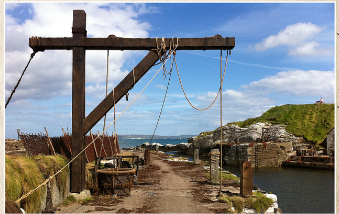
Ballintoy Harbour

THE CAUSEWAY COAST AND GLENS GAME OF THRONES ITINERARY IS A THREE-DAY VOYAGE OF DISCOVERY THAT LETS YOU EXPERIENCE THE FANTASY WORLD OF AUTHOR GEORGE R.R. MARTIN FOR YOURSELF. PLOTTING A PATH THROUGH THE SCENIC SPLENDOUR OF THE SEVEN KINGDOMS, IT TAKES YOU TO WHERE SO MANY OF THE PIVOTAL SCENES WERE SHOT.